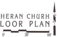
GRACE LUTHERAN CHURCH FLOOR PLAN